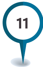
Conducted 11 training sessions