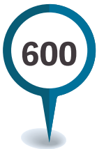
Engaged more than 600 stakeholders in our events