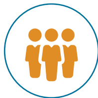
Doubled number of staff