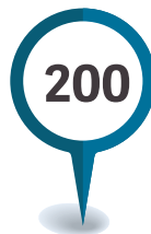
Surveyed more than 200 individuals to enhance our services