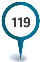
Raised the capacity of 119 Individual