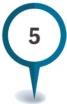
Held 5 power breakfasts