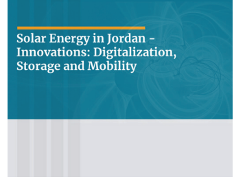
Solar Energy in Jordan -Innovations: Digitalization, Storage and Mobility