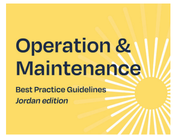
Operation & Maintenance – Best Practice Guidelines Jordan edition