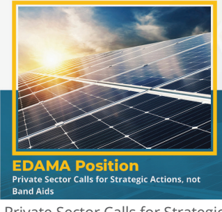
Private Sector Calls for Strategic Actions, not Band Aids