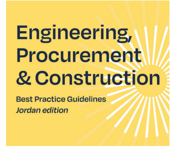
Engineering, procurement & construction – best practice guidelines jordan edition